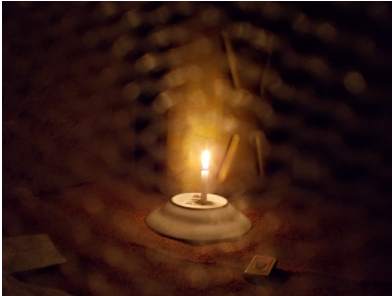
Figure 3: “Because people tell me that I can die anytime, I fear darkness and I have to light a candle every day before I sleep. This also is very dangerous because one time I almost got burnt while asleep, yet I stay alone in my room.’ (Dagie, 17-year-old boy).” 58

year-old boy who participated in this photography study. The picture is not a portrait, but it is still deeply personal, giving a glimpse into the fear that continues to be part of the lives of many people living with HIV. In this, the photograph contradicts the notion that only faces can evoke emotion in a crisis situation. 59 The photograph, containing a candle seen through a wired fence, conveys Dagie’s fear of death and his need to leave a candle burning at all times because he is unable to sleep in the dark. The physical barrier present in the picture also conveys a feeling of Dagie’s isolation from the rest of his surroundings. This feeling of isolation is frequently seen in photographs surrounding stigma. 60 Many participants in the study communicated to the researchers that they felt ostracized in their social circle, being present but not being afforded the ability to